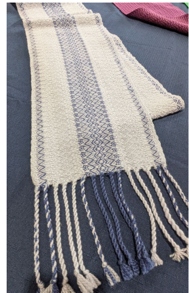
Sue Szczotka wove this beautiful scarf with a twill pattern from Strickler's book.