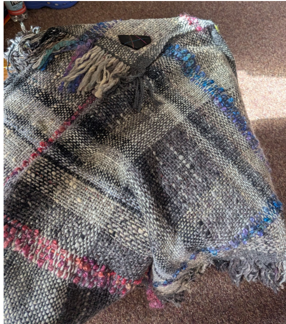
Bernd Krause created this wonderfully textured poncho with a variable dent read on a rigid heddle loom.