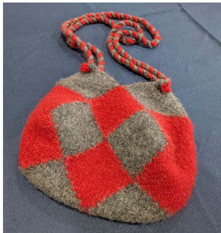
Sue Szczotka kicks these pin loom squares up another notch with a wonderfully thick fulled-wool bag.