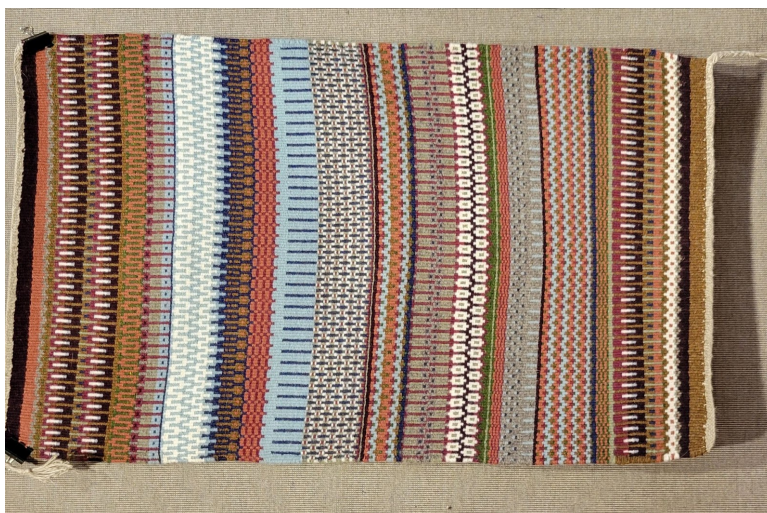
Eileen's Krokbragd Rug