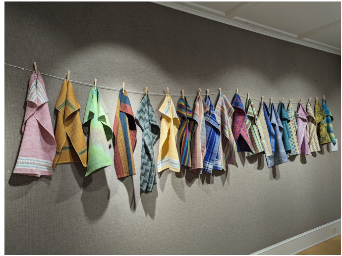
Dish Towel Clothesline at TIAC

Our May 2024 Artists' Talk tinyurl.com/TIAC-Better-Together and guild exhibit, Better Together, at the Thousand Islands Art Center in Clayton, NY was a hit! With over 30 beautiful handwoven pieces on view in the exhibit, our group piece - the dish towel clothesline - was a show favorite and a true reflection of achieving good things together!